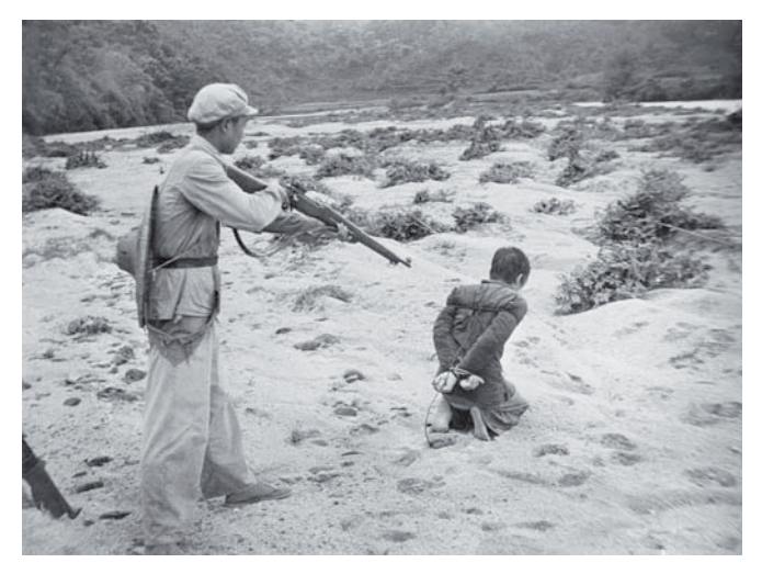
9. Land redistribution in the early 1950s was a time of joy for many peasants, but it also led to a deadly terror campaign against those judged to be 'landlords'. The landlord in this picture, taken in 1953, owned around two-thirds of an acre

countries did open up diplomatic relations, the country was economically relatively isolated, even though it now had a formal cooperative relationship with the USSR. When relations with the Soviets also started becoming chillier in the mid-1950s, as Mao expressed his anger at the Khrushchev thaw, the CCP leaders' thoughts turned to self-sufficiency as an alternative. Mao proposed the policy known as the Great Leap Forward. This was a highly ambitious plan to use the power of socialist economics to increase Chinese production of steel, coal, and electricity. Agriculture was to reach an ever-higher level of collectivization, with individual plots (the basis of the popular land reforms of Mao's first years in power) being subsumed into large collective farms. Family structures were broken up as communal dining halls were established: people were urged to