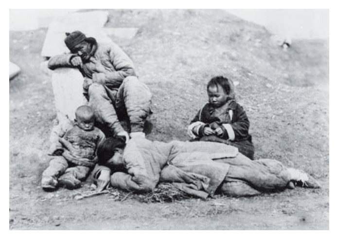
3. This picture dates from the 1930s, but from the mid-19th century, famines struck frequently in China, fuelling popular disillusionment with government

be unreliable and marred by massive corruption in the late Qing, despite the reforms.