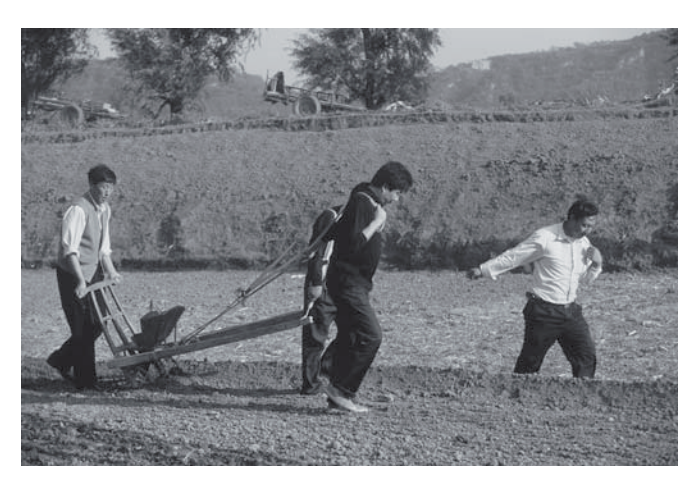
15. Despite significant spending on science and technology, traditional agricultural techniques are still widely found in the Chinese countryside

Y500,000. Furthermore, popular aspirations are phrased in terms that make it clear that the old, agricultural China is regarded as the past, not the future: a college education, a pleasant city apartment with running water and flush lavatory, consumer goods (electronic equipment, white goods, a car), and services (leisure travel, cable television). In the countryside, in contrast, the only widespread consumer goods are television sets, leading to the bizarre sight of remote villages with open toilets and no running water, but with a television constantly switched on, usually at top volume. There have been extensive tax cuts and subsidies to the rural areas, but in 2005, rural families were still spending over 52% of their incomes on essentials (food and health care), as opposed to around 43% for urban families, suggesting that it will be some time before they have much spare cash to buy consumer goods. A new phenomenon is the huge, largely illegal, movement of migrant labourers within China (perhaps 150-200 million