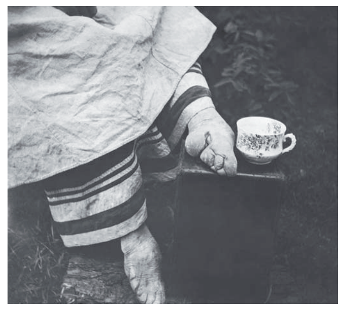
14. For centuries, Chinese women had their feet bound from an early age so that they never grew to full size. The custom was abolished following the action of reformers in the late 19th and early 20th centuries

Opportunities for women were restricted overall in imperial China. They could not join the bureaucracy, nor were there many opportunities for them to become traders. Confucian culture did regard women as intellectually less capable than men. However, in the late imperial era, it was quite normal for well-off families to insist that women were literate. In particular, elite women during the early Qing (the 17th and 18th centuries) developed a public voice of their own in one particular area: publishing. This period coincided with a growth in mass woodblock publishing (see Chapter 6), and women writers of the era took advantage of the existence of a new readership to make their views and interests known. The Ming dynasty had seen a culture of literate