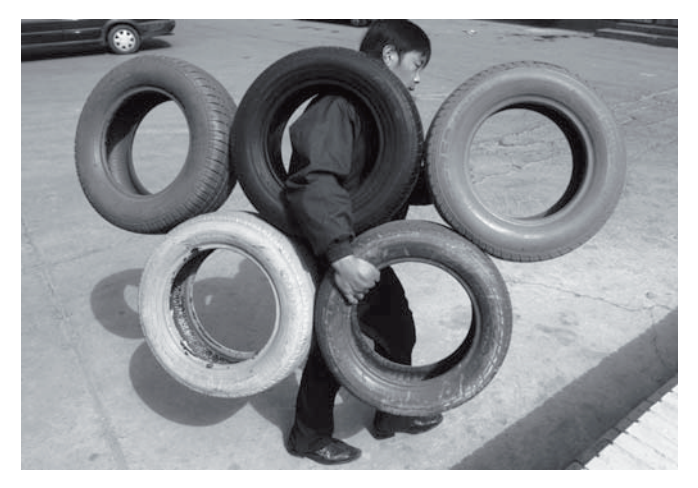
16. Beijing geared up for Olympic fever after being awarded the Games in 2001. Here a worker carries an Olympic Rings decoration made of waste tyres from a car-wash

which attempted to drill the Chinese population into regulating their behaviour (see Chapter 3). However, despite its failure in the 1930s, there are strong and ever-more-explicit echoes of the New Life Movement in contemporary China, where points are given by local committees to residents who throw away their garbage and put out plants to decorate their houses. In the run-up to the Olympics, Beijing residents were told of a new 'morality evaluation index' which would give credit for 'displays of patriotism, large book collections, and balconies full of potted plants' and lower grades for 'alcohol abuse, noise complaints, pollution, or a violation of licences covering internet cafes and karaoke parlours'. Public toilets in tourist areas are also being upgraded and star-rated.