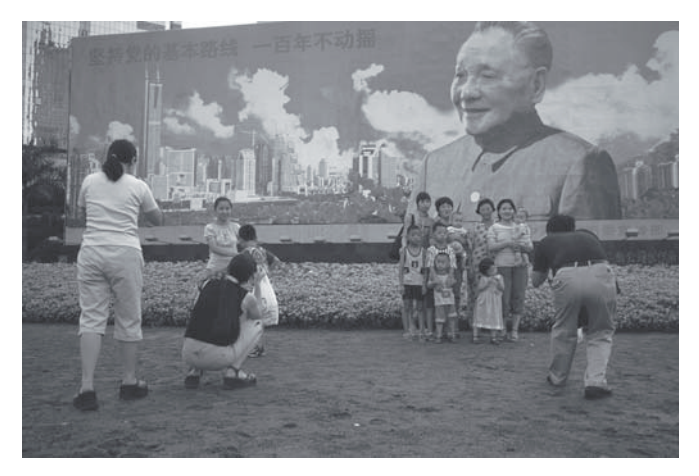
12. The economic reforms that have transformed Maoist China are associated above all with Deng Xiaoping, paramount leader from 1978 to 1997, who is depicted here in the background as tourists take pictures

used valuable foreign exchange to import 79,000 foreign cars, 347,000 televisions, and 45,000 motorcycles for resale at inflated prices. (Yet Lei was rehabilitated in 1988, and his behaviour was only the most outrageous example of a widespread phenomenon of corruption.)