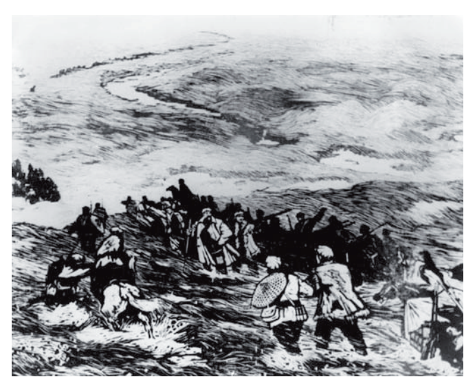
7. The Long March of 1934–5 helped Mao rise to paramount leadership of the Chinese Communist Party. This image is taken from a tapestry depicting scenes from the March

In 1934, the party began the action that remains a legend to the present day: the Long March. Travelling over 4,000 miles, 4,000 of the original 80,000 Communists who set out finally arrived, exhausted, in Shaanxi province in the northwest, far out of the