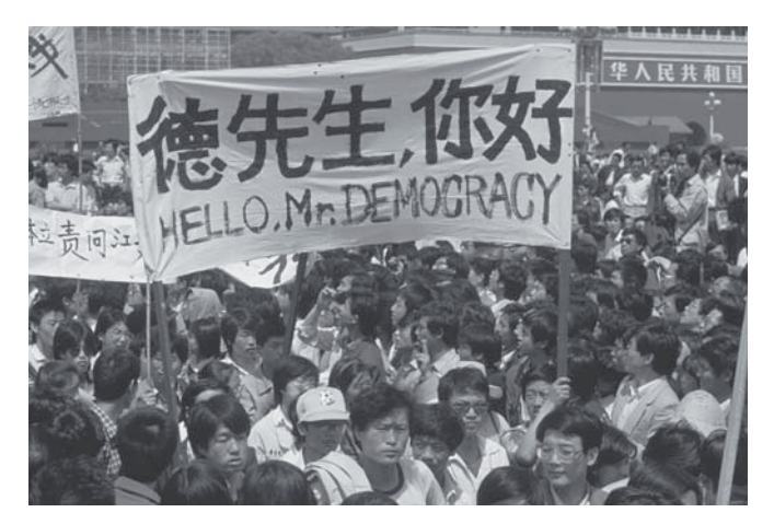
13. On 4 May 1989, exactly 70 years after the original May Fourth demonstrations in 1919, students once again ask for 'Mr Democracy' in Tian'anmen Square. A month later, tanks and soldiers would clear the Square by force, killing large numbers

1919, students published journals with titles such as 'New May Fourth', and declared the need for 'science and democracy', the modernizing watchwords of 80 years earlier, to be revived. On 4 May 1989 itself, protesters in Tian'anmen Square held up signs, written in Chinese and English, reading 'Hello Mr Democracy!', a clear reference to the May Fourth duo, 'Mr Science and Mr Democracy', who had been tasked with China's salvation 70 years earlier.